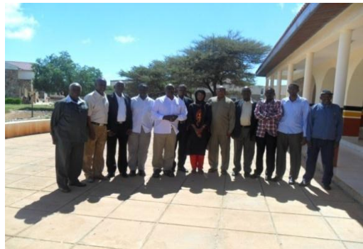
Director in Somaliland for accreditation of Sheik Technical College.