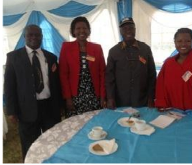
Ag. Deputy Principal Kenya Science and President of Commonwealth of Learning at the DETA 2013 Conference at Kenya Science