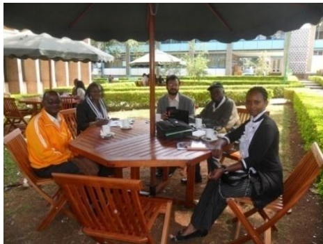
Consultation on e-learning Solution Tablet At Arziki Chiromo Campus 3 rd Aug 2013 and demonstration at Multimedia Conference Centre