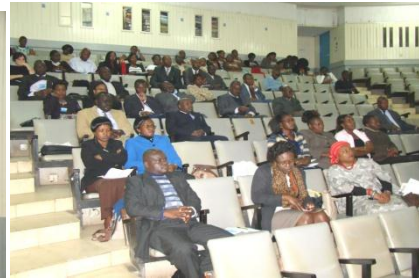
Participants at the launch of Med Admin & Med Found