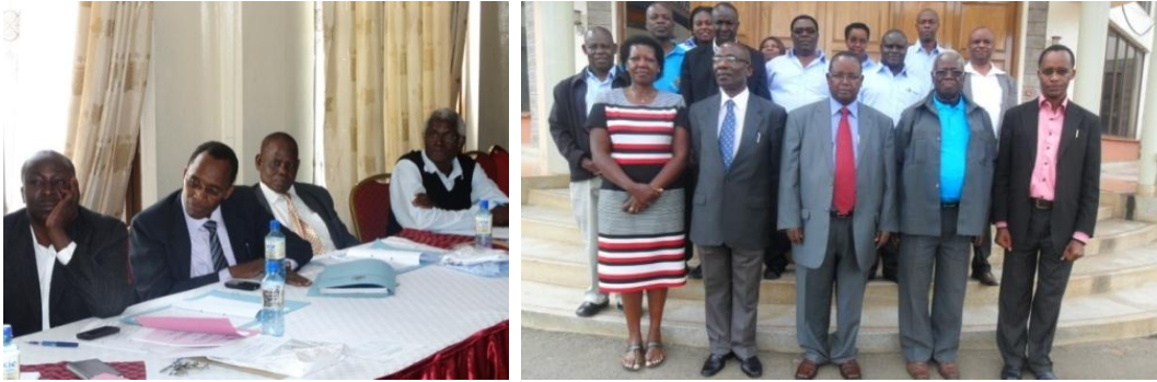
Stakeholders at the Strategic Plan Principal CHSS and MD UNES at close of Workshop