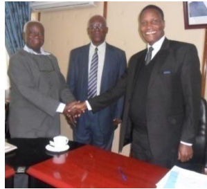
IT Committee briefs Cabinet Secretary