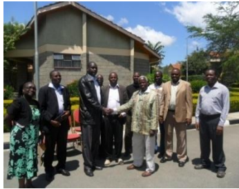
Director CODL and the DVC AA Laikipia University at Morendat

The Centre collaborated with Laikipia University, Moi University and Rongo University College in capacity building for self-instructional materials and conversion of materials to e-learning mode in workshops held at Morendat Conference Centre, Pinetree Hotel Eldoret and GRABO Hotel Migori