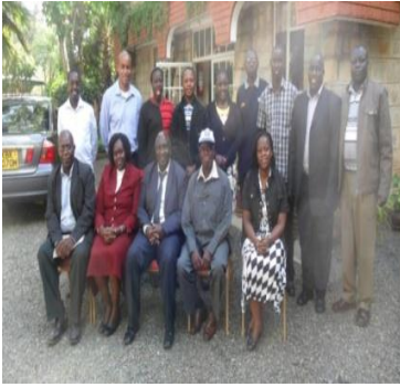
Coordinator CODL, Dean SCDE & Director CODL At DETA 2013 Conference at Kenya Science