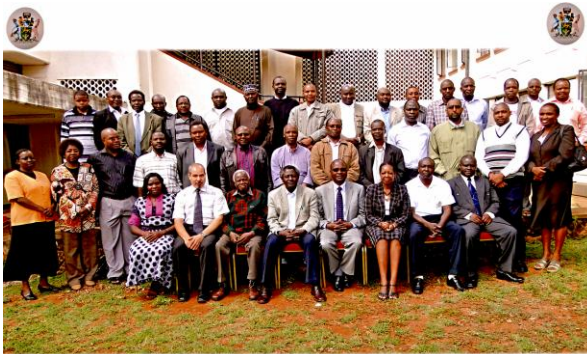
WRITERS SECOND WORKSHOP FOR BSc. MOP-UP STUDY MATERIALS DEVELOPMENT FROM 13th - 18th DECEMBER 2010